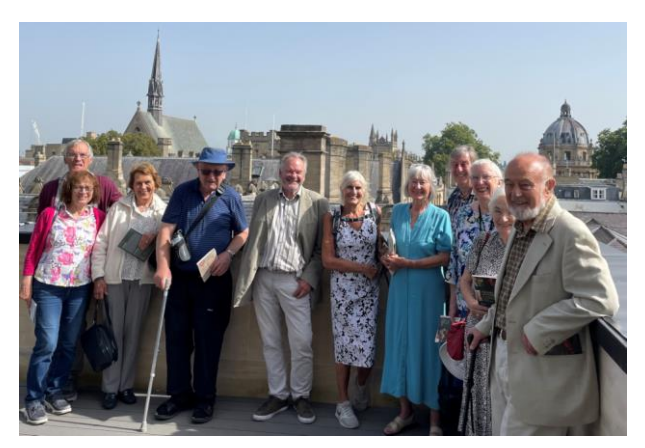
The view from the top of the building is wonderful, and we stopped for a group picture.

We then walked through the Third Quadrangle and over to the most recent addition to the college – the Cheng Yu-tung building, which is very modern and contains up-to-date teaching rooms, student accommodation and a 'digital hub'.