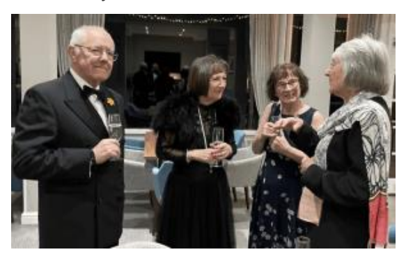
School. Our mutual acquaintances were numerous; a joyful start to the evening.

All 50 guests were greeted with a glass of bubbly or soft drink – as appropriate. The lounge provided an excellent space to catch up with old friends and indeed some guests from the principality – Whitland to be precise. I was delighted to meet with the brother of one of my classmates at Narberth Grammar